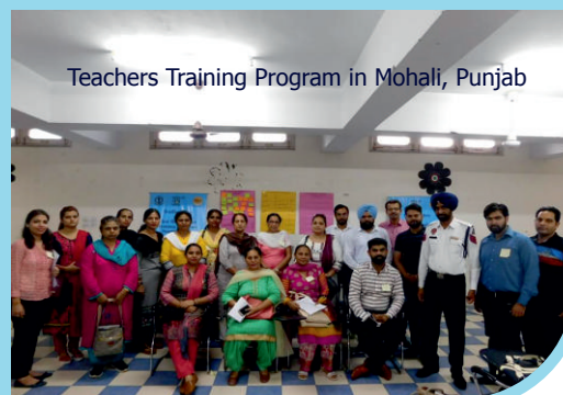
Teachers Training Program in Mohali, Punjab